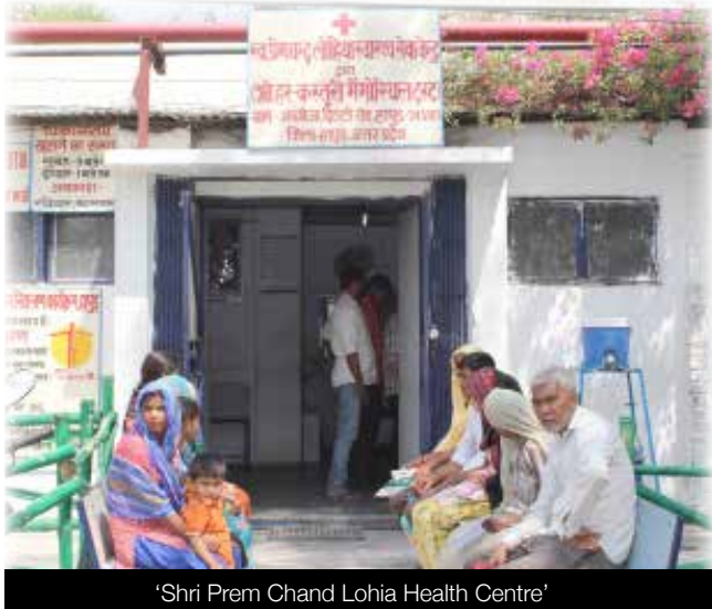
'Shri Prem Chand Lohia Health Centre'

treatment in about 72 villages in the district of Hapur, Uttar Pradesh.