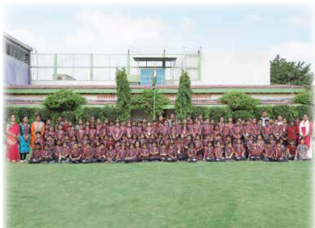
SVAV students with teachers

and a computer centre ensure students get access to updated modern education. The school campus also has infrastructure to support various kinds of games and sports facilities. The school takes a step beyond just education with provision of nutritious meals and good clothing for all its students.