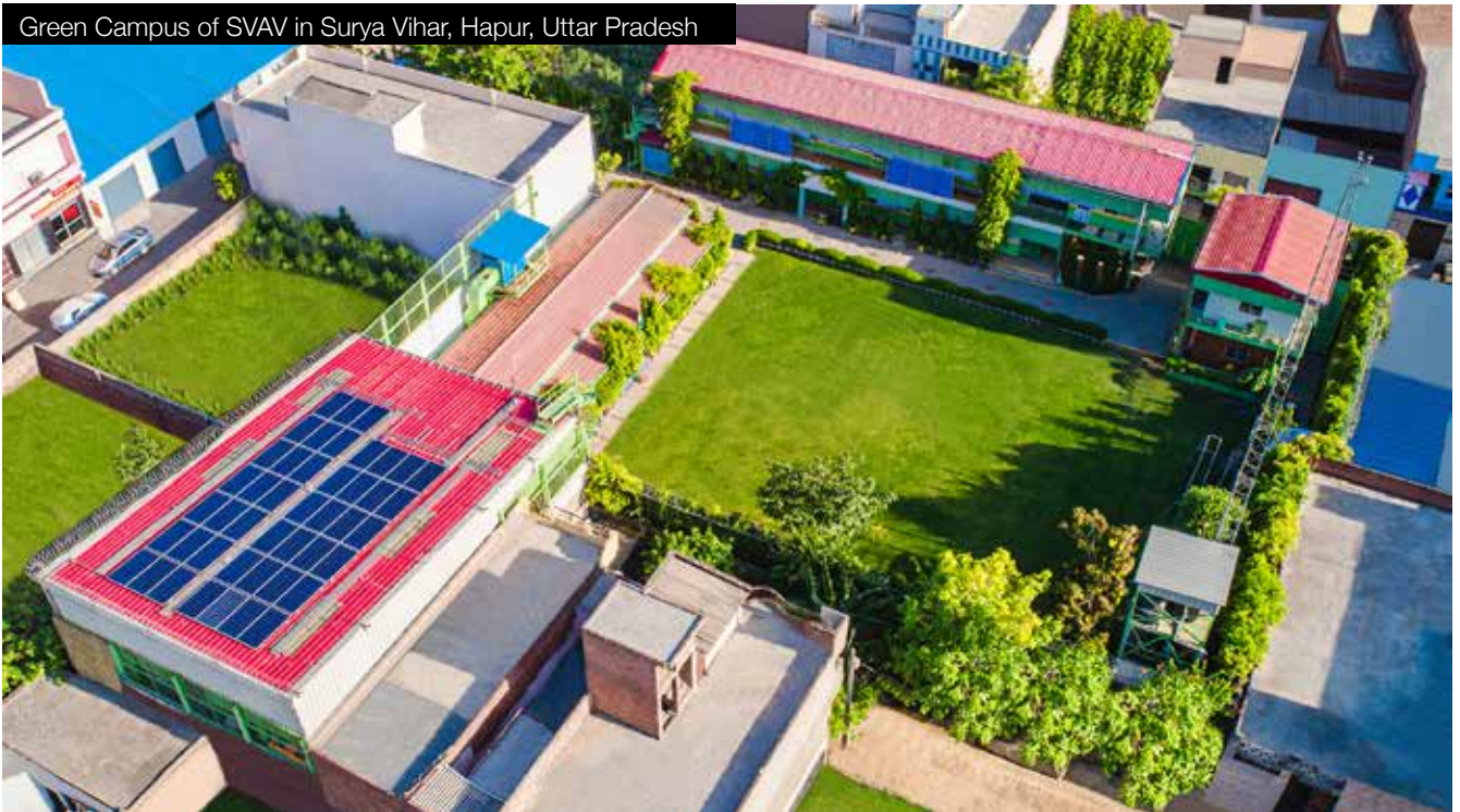
Green Campus of SVAV in Surya Vihar, Hapur, Uttar Pradesh