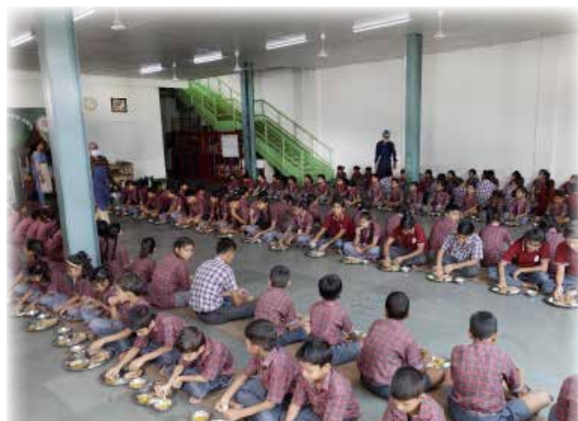
Student enjoying the mid-day meal

day with a plan to increase this to 750 students daily at Hapur (UP) and its surrounding areas.